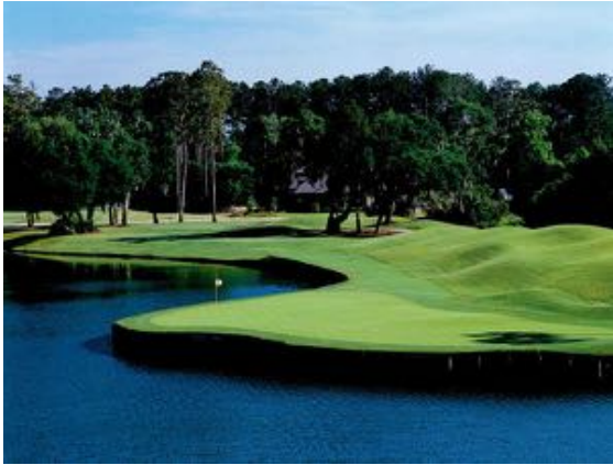
Above – TPC Sawgrass, Dye Valley