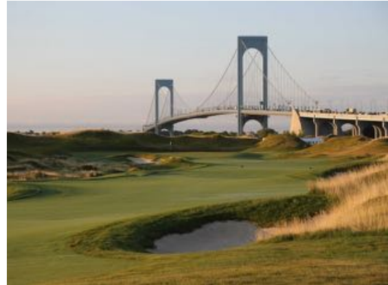
Trump Ferry Point

Our first game of golf on tour is at the Trump owned course at Ferry Point. This links style course has fantastic views of the Manhattan skyline.