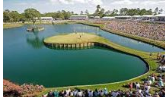
Above – TPC Sawgrass, Players Stadium Course

Sawgrass. The course has just re-opened after the 2016 Players Championship with some major course modifications and 18 new greens. Whatever, you do make sure you concentrate hard on the tee shot on 17.