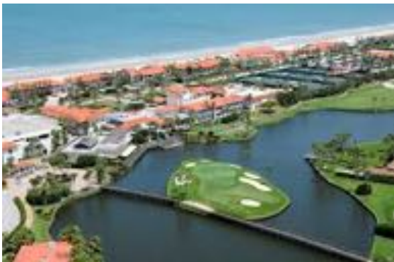
Above – Ponte Vedra Beach Inn and Club.

Morning – A short drive over to the Ponte Vedra Beach Inn and Club for our next game of golf. This club is a private club in Ponte Vedra Beach and one of the best courses in Jacksonville.